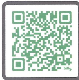
60TH MYC - REGISTRATION

Alternatively, you can access the registration form by scanning the QR code below: