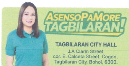
JANE CENSORIA C. YAP City Mayor LR

VISION: "A Highly Urbanized, Resilient and Livable City by 2030"