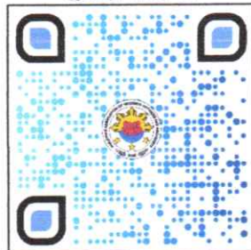
QR for Live-In

https://qr.me-qr.com/I/PAROA-Rdy4Dsstr-25LI