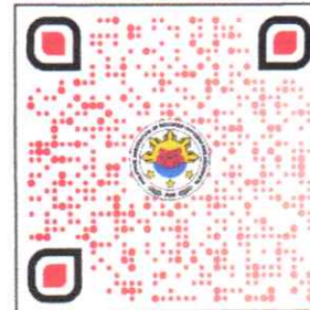
QR for Live-Out

https://qr.me-qr.com/I/PAROA-Rdy4Dsstr-25LO