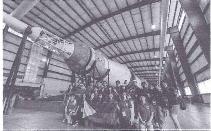
NASA Johnson Space Center, Houston Texas

Moreover, the Space Rocket Challenge involves building air-powered rockets, a task that introduces students to principles of aerodynamics and mechanical engineering. These activities not only build technical skills but also encourage critical thinking, problem-solving, and innovation—key competencies in modern education.