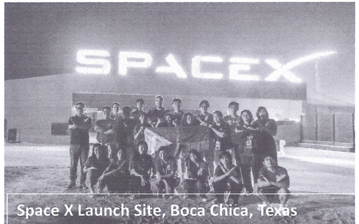
Space X Launch Site, Boca Chica, Texas