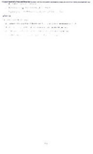
Registration Mechanics_1.jpg 1323K